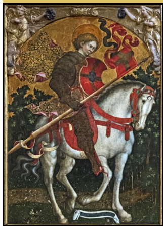
Saint Chrysogonus, Pray for us!