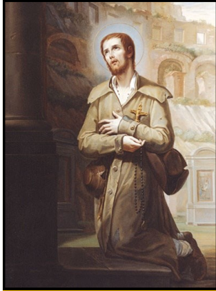
St. Benoît –Joseph Labre Pray for us!

Apr 16: St. Benoît-Joseph Labre (1748-1783) is a Frenchman, who at the age of 22 decided to become a permanent pilgrim living on alms; he wanted to replicate that unique aspect of Jesus’ life with “nowhere to lay his head.” By the age of 26 he was sleeping in the rough of the colosseum, but rapt in prayer before the Blessed Sacrament. Visit his relic shrine in the Madonna dei Monti church in Rome. He died at the age of 35. He is the patron saint of tramps, beggars, the homeless and pilgrims.