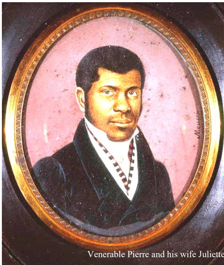
Venerable Pierre and his wife Juliette Noel Toussaint c. 1820 New York City