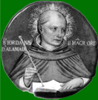
Bd. Jordan of Saxony

German second-in-command of the Dominican Order, provided significant material on St. Dominic but has also left detailed insight into his personality through a series of letters written to Bd. Diana d'Andalo (whose relics we venerate in Bologna).