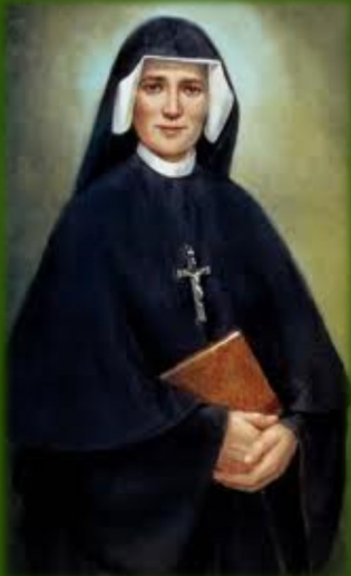
St. Faustina Kowalska