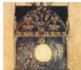
Case containing the stone