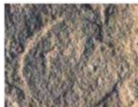
Imprint of the First Host