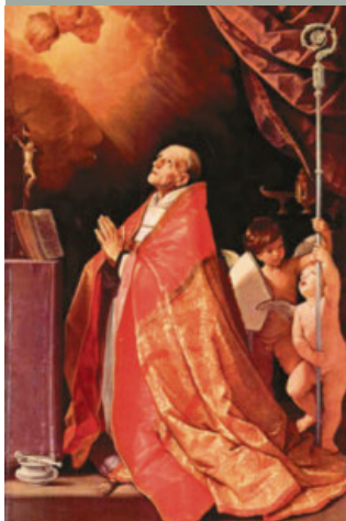
St. Lorenzo Giustiniani, Pray for us!