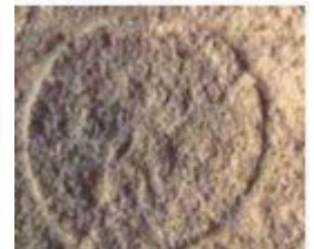
Imprint of the Second Host

Scan the QR code to visit Blessed Carlo Acutis website for details on this Eucharistic Miracle and MANY MORE!