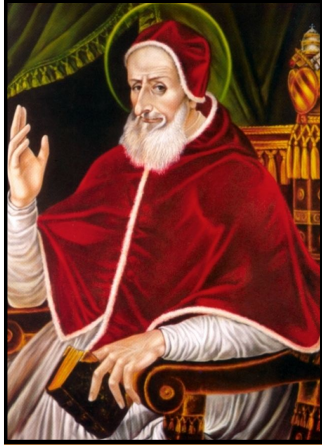
St. Pius v Pray for us!