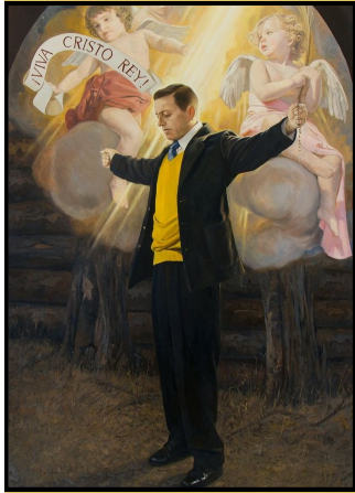
Bl. Miguel Pro, Pray for us!

Nov. 18: St Rose Philippine Duchesne (1769-1852) When she arrived as a missionary sister in St. Louis Mo., her first act was to build a shrine to St. John Francis Regis, for whom she has a great devotion. Her body is enshrined in St. Charles, Mo.