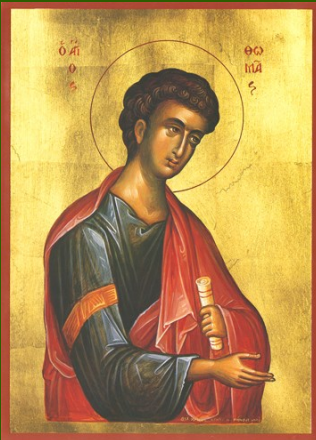
St Thomas the Apostle

For everything there is a season, and a time for every purpose under heaven: a time to be born, and a time to die; a time to plant, and a time to pluck up that which is planted. A time to love, and a time to hate; a time for war, and a time for peace.