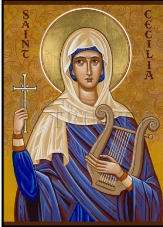
St. Cecilia Pray for us!