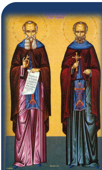
St. Basil &amp; St. Gregory