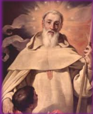
St. Peter Nolasco