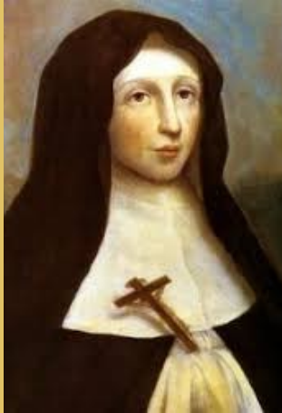
Bd. Catherine of St. Augustine, Pray for us!

May 4: St. Florian (304+). Patron saint of Firefighters was scourged, flayed and cast into the river Emms where it flows into the Danube in Austria.