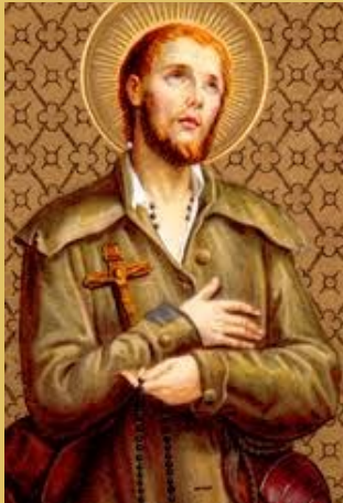
St. Benoît –Joseph Labre, Pray for us!

Apr 13: St. Martin I (655+) is the last pope (so far) to have been publically scourged and martyred. He was tortured and imprisoned in Constantinople, exiled to Crimea, where he died of his injuries as a martyr.