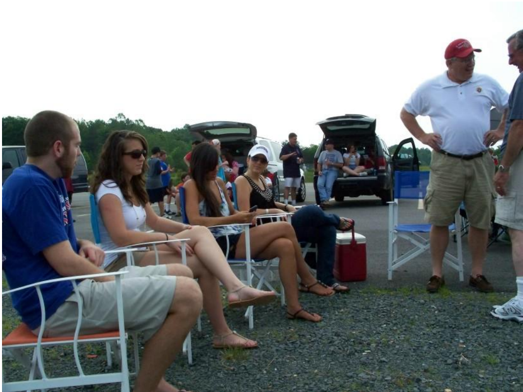
Knights and families enjoying some pre-game camaraderie before the Blue Crabs baseball game.