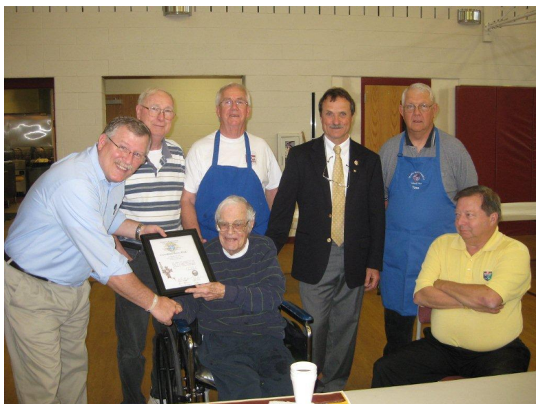
Carrollton presented "1 st Degree Honoree" Certificate