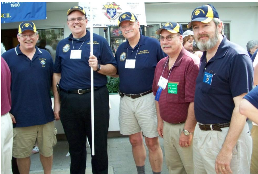
Your 2 nd place GK Olympic Team