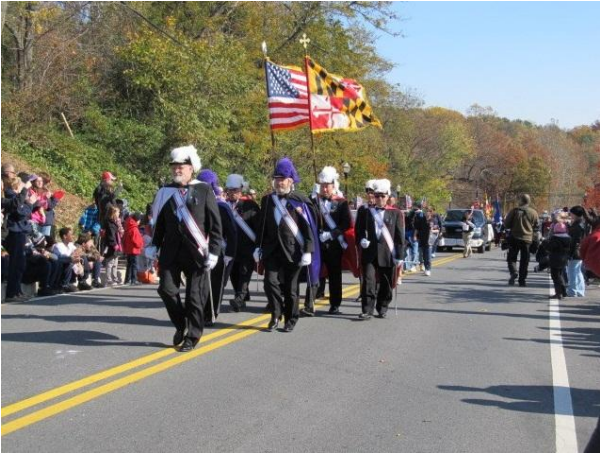
Veterans Day Parade