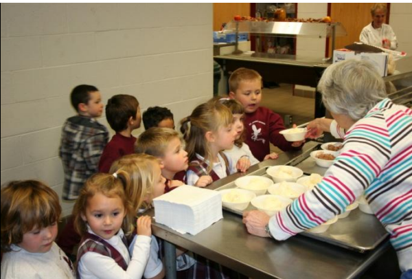
Back to school Ice Cream Social was a big hit again this year