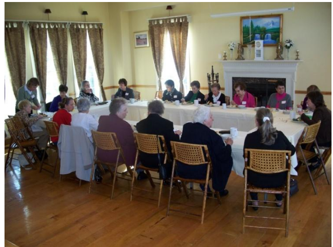
Our Ladies at the Victorian Candle Luncheon