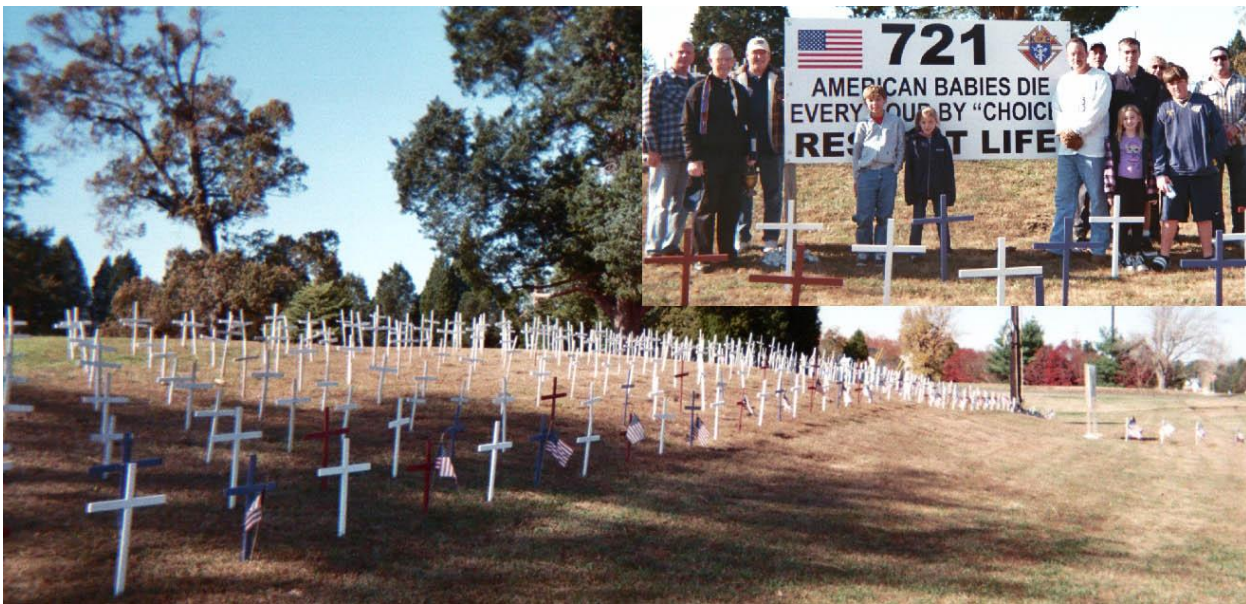
Setting up the Cemetery of the Innocents