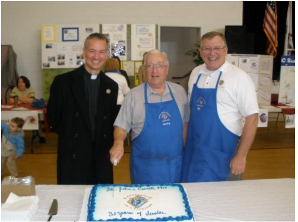
Council's 30 th Anniversary celebration at Ministry Fair