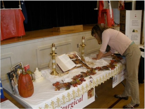
Ministry Fair at St. John's